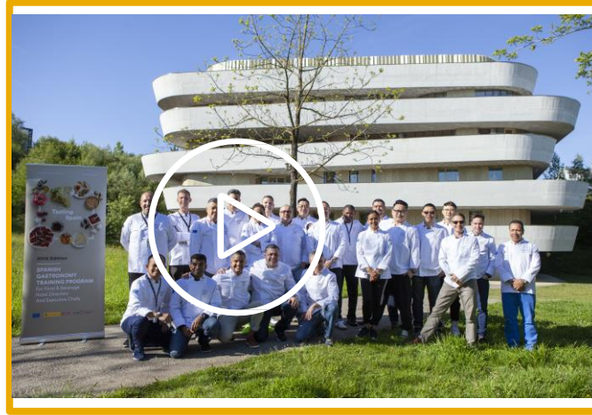
2019 EDITION (video)