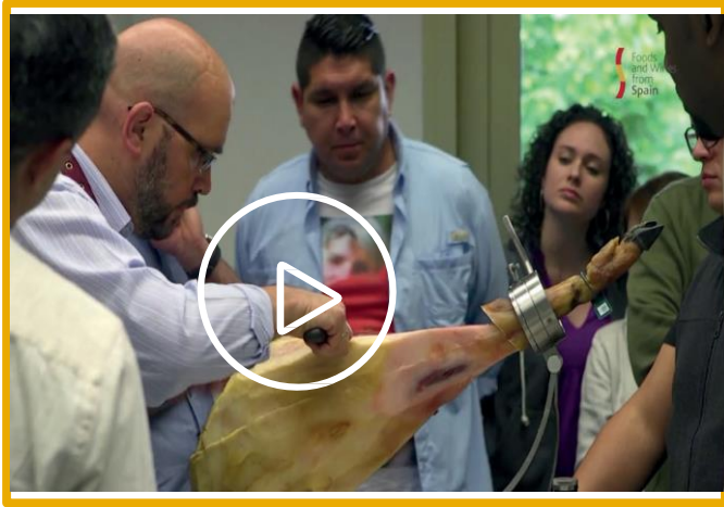
2018 EDITION (video)